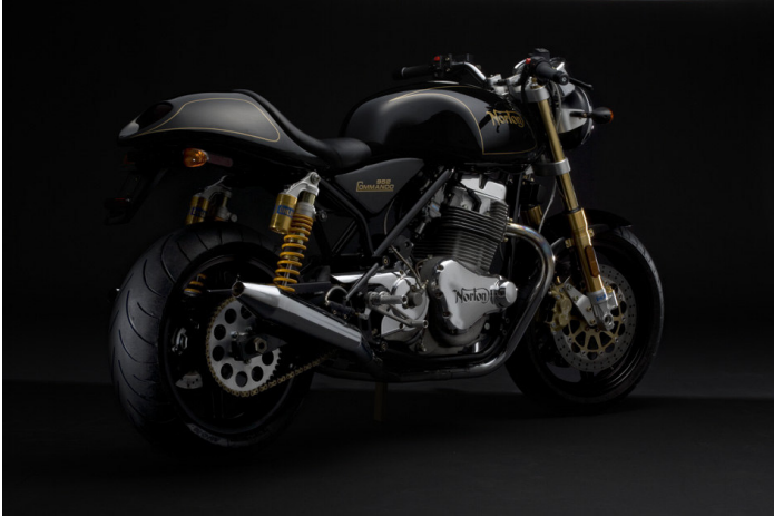
New Norton Commando 961

Springfield Milers C/o Hellar Armbruster 8600 Old Route 66 South Springfield, Illinois 62712 armbruster@springnet1.com 217-483-2463