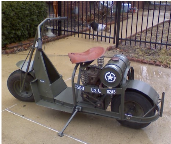
Completely finished unit