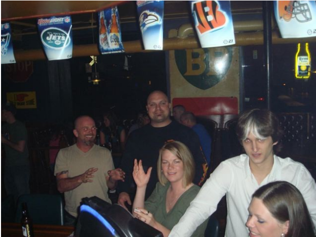
Making friends with the locals

Friday we ate again at the ever fabulous California Juice Bar, with a first class gourmet dinner. Then we were off to downtown Cape to rock it out with the locals. The cross river expeditionary force to Hussein Pumping took off late, with one casualty left behind to fend for his own way back home.