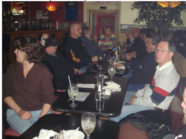
Great Greek Dinner