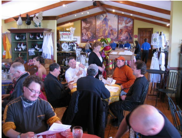
Great Lunch stop