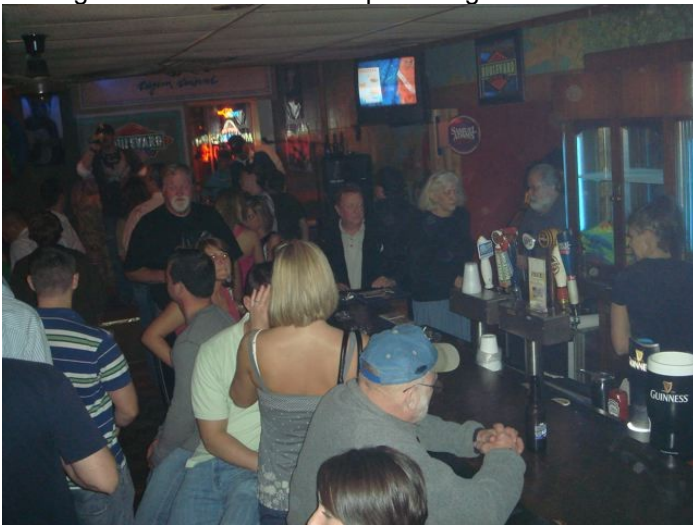
Cooling off Cajun Dinner with drinks