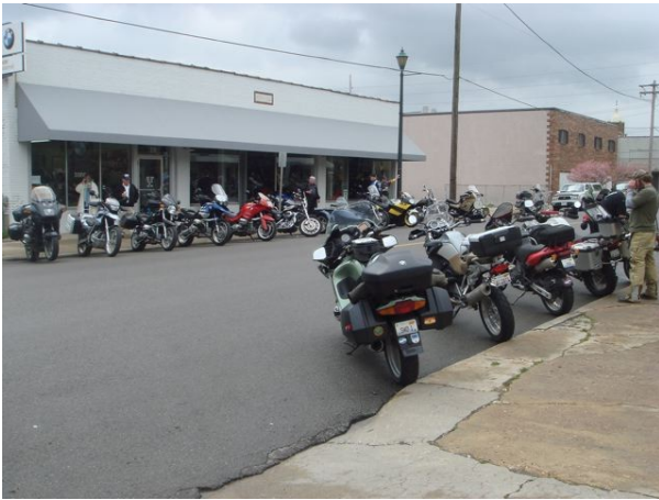
BMW shop for brunch