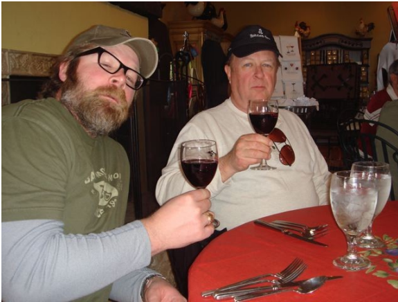
Taking the Edge off