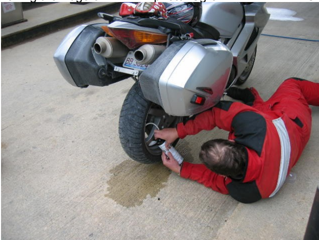
Bummer for Chip