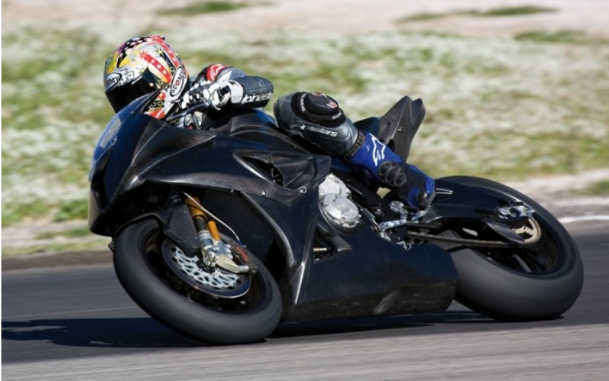
NEW BMW S1000RR SUPERBIKE