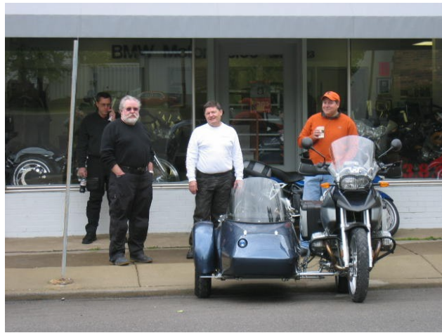
What a waste of a GS photo: Editor