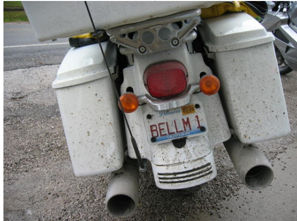
Bellm's bike Dirty?