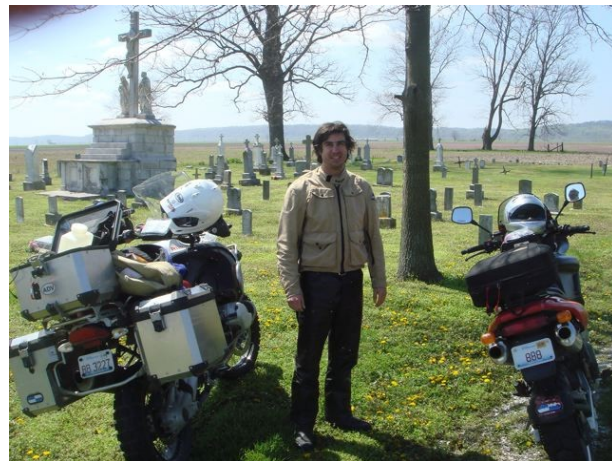
Graveyard stop along "C" coming home