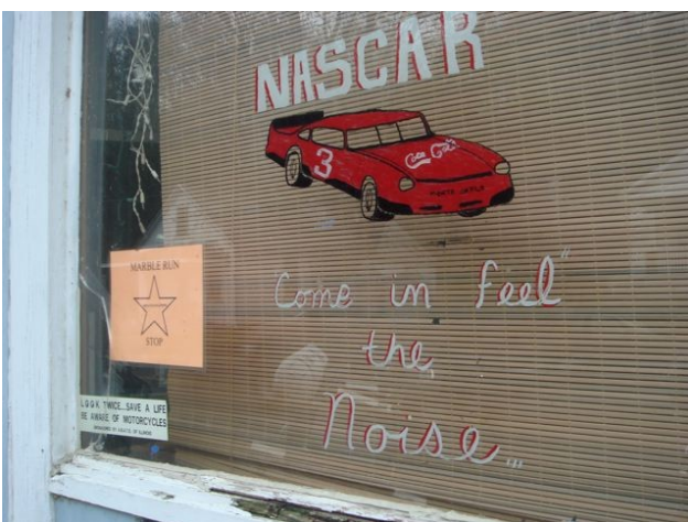
JB loved this sign!